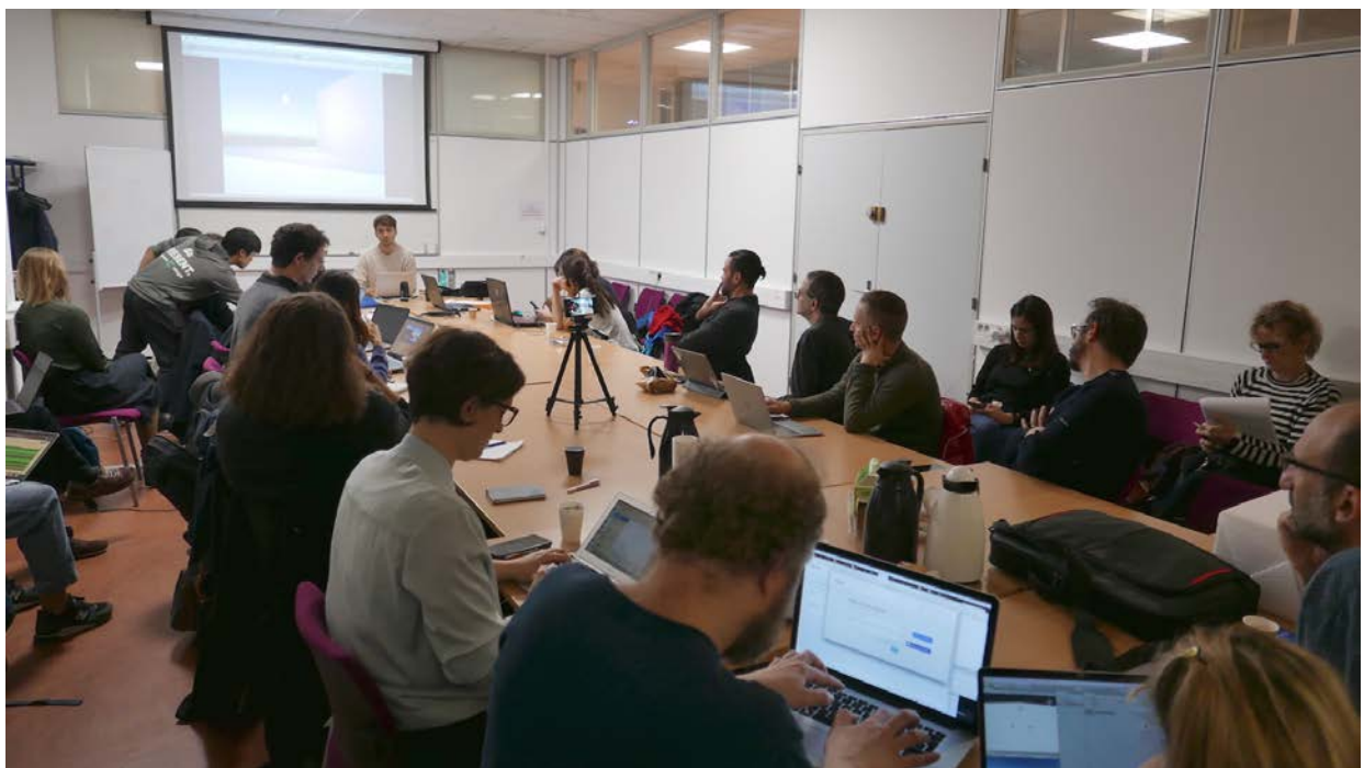
Tutorials (Unity, etc)