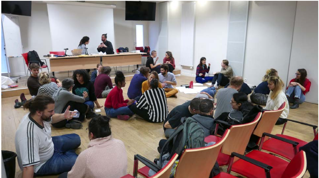
General assembly: Introduction to the VR platform and collective brain storming